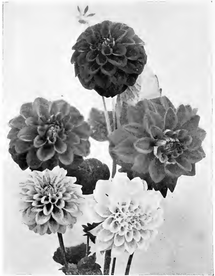
Rufus Amaranth Othello Babette Larry

SPECIAL OFFER No. 13. We will send one strong root each of the above new Rosette Dahlias, 5 in all, by mail postpaid, for $3.75.